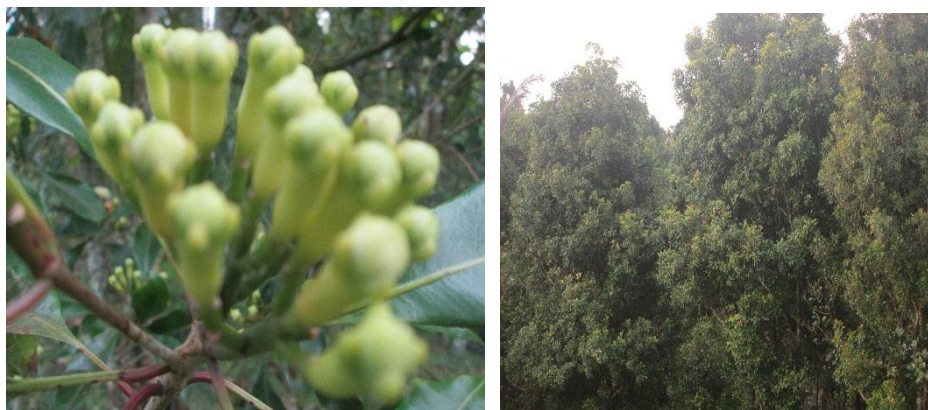
Figure 1. Clove plant

Organic fertilizers are also effective in increasing P uptake and increasing soybean yields ( Supriyadi et al., 2016 ). Organic fertilizer combined with 30% compost can increase the yield of red Balinese rice ( Suriani et al., 2019 ).