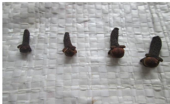
Figure 3. Dry clove flowers from left to right F0, F1, F2, F4