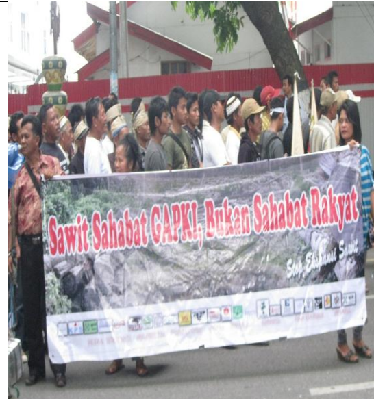
Figure 4: NGO's Campaign 2

The phenomena of anti-language from media, NGO's and complex problems in palm oil plantation including policies from the government have become demanding challenge to overcome (Sawirman, 2012). These problems have long-term impacts which corrupt national character in the society around the plantation. The spectrum of the problems is wide such as conflicts among the society, companies and NGO's. Anti-language used in common by NGO's attack the companies, palm commodities, and even the government.