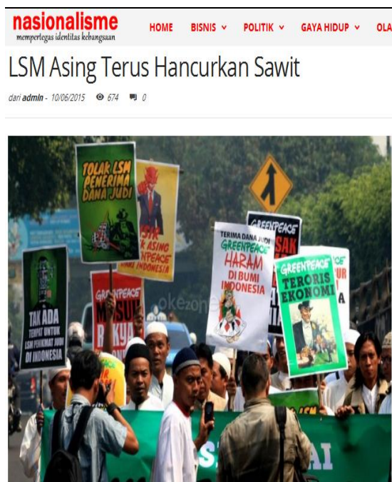
Figure 1: Companies's Campaign 1

War on discourse between GAPKI's campaign and NGO's campaign are opposites. GAPKI stands for Gabungan Pengusaha Kelapa Sawit Indonesia (The Indonesian Palm Oil Association) . GAPKI not just claims that the export of crude palm oil (CPO) has increased each year, but also put a target to develop palm oil expansion continuously. As stated by GAPKI, numerous companies, businessmen, and capital owners have also developed the use of palm oil, palm kernel, and the remains of palm processing. Those products according to GAPKI have been exported overseas. Some researchers also explores that the roles of palm oil companies and agro-industries companies are also quite significant in reducing the number of poverties and unemployment in international level such as in Indonesia ( van Gelder, 2001 ), in Thailand ( Watnapinyo, 2007 ), in Nigeria ( Oladipo, 2008:75-87 ), in Costa Rica ( Orozko dan Morillo, 2007 ). Furthermore, the contribution of palm companies on various aspects like granting the scholarships for the students, sporadic donations for numerous people's events and activities actually can enhance the development of the region in which the palm company operates. Anti-language has the natures of anti-thesis in linguistic dialectics. It's also used by palm oil companies and society to attack NGO, as in the following figures.