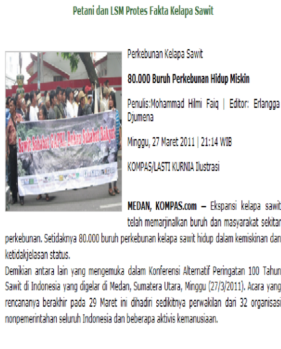
Figure 5: NGO's Campaign 3