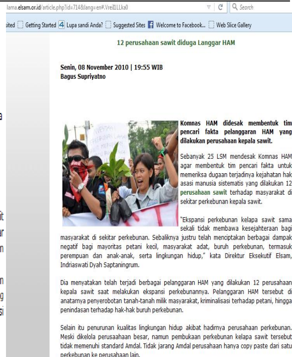
Figure 6: NGO's Campaign 4

Even though most of the content of industrial companies' contract in Indonesia is not contradicted by the law, public order and decency, but there are no local outsourcing workers who been included to make the contents of the contract. It has an impact on equal points toward the contents of the contract. According to Minister of Manpower Regulation number Per-02/Men/1993 on Certain Time Employment Agreements that the employment agreement for a specified time only is held for a specific job based on nature, type, or activities which be completed within a certain time. For example, the estimated job which can be completed in not too long time and a maximum of three years. In the hierarchy of the production process, the labor is the perpetrator of the bottom process. However, their role is significant to the survival of a business. Unfortunately, the fate of the workers has not received a serious the attention. Various injustices lead to lack of prosperity because of no social warranty and future uncertainty. Subcontract at the local level such as in the industrial and service companies in Indonesia have not received adequate attention even by the Labor Law that had legalized by The House of Representatives (DPR) in 2003. Here is one of the contract fragment cases between MH (initial name) and KA, Inc based on the PAS-e analysis.