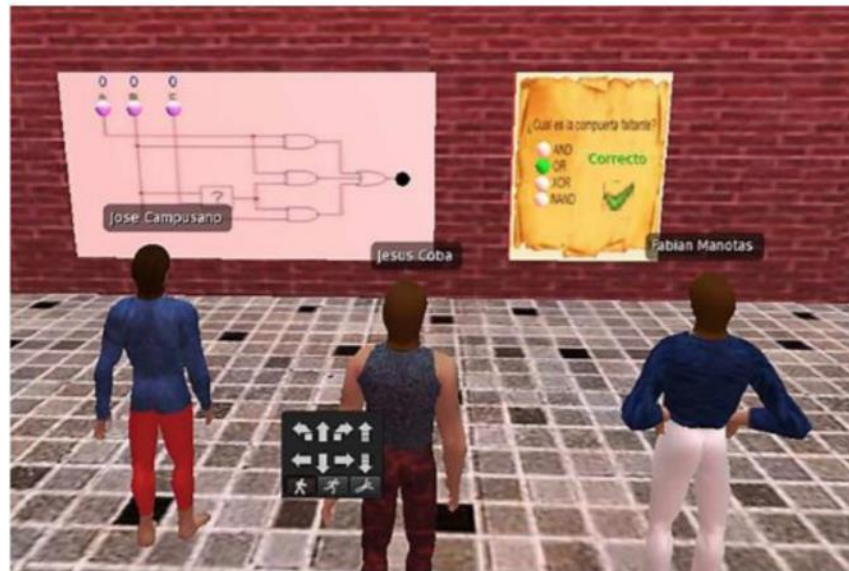
Figure 2. Users Participating through Avatars in a 3D Virtual Space (Comas Gonzales et al., 2017)

Representing reality in an immersive virtual environment by creating a 3d learning space makes participants feel that they are in a different environment from the classic computer desk, with the use of avatars, communication becomes more personal and assertive (Comas Gonzales et al., 2017). In figure 2, a virtual environment using avatars is shown.