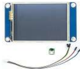
Figure 2: Device Nextion NX3224T024. Presented by Itead [12].

The Arduino Uno was selected for this project, due to its compatibility with the devices that should be part of this study, due to the fact that the device NodeMCU 12e presented by Veloso et al. [28], which is a superior competitor to Arduino Uno, but it does not have all the ports required for use with the ILI9341 model.