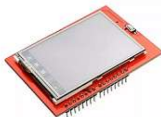
Figure 3 Device ILI9341. Presented by Adafruit [1].

The ILI9341 TFT device presented by Adafruit [1] is one of the most inexpensive and easy-to-locate devices to purchase, both nationally and internationally, easily accessible nationally and at very affordable prices, this device is the most common for use with projects for Arduino, or for the internet of things. For this study, the Arduino Uno device should only be used as a development and operation platform to demonstrate the main features of Nextion and ILI9341, without the use of the Internet, or any more sophisticated features.