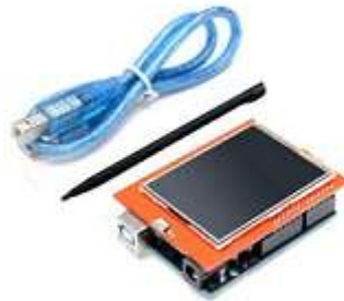
Figure 6: Device Arduino Uno connected to the device ILI9341. By the author.

The wiring diagram follows the guidelines given on the manufacturer's website in Itead [12]. Authors Abdullah and Putra [2] present in greater detail the use of IDE presented by Itead [12], together with Nextion, demonstrating a practical application of the devices and their tools.