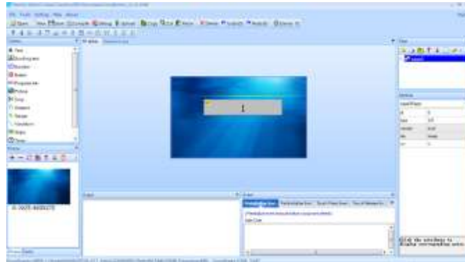
Figure 4: Development screen of Itead Editor for the project CompButton_v0_32.HMI . Adapted by the author.

There were no problems with the Nextion device working in conjunction with Arduino Uno because the size and processing capabilities demonstrated the code used.