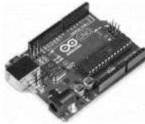
Figure 1: Arduino Uno presented by McRoberts [19].

Veloso et al. [28], explains that the NodeMCU is from the ESP8266 family (a device for connecting to the Internet by WiFi), being one of the easiest to use, and it is not necessary to use another device like Arduino, because the same already has the necessary processing capacity to run your applications, still has the direct connection to WiFi, without the need to install new devices or extra libraries, unlike the Arduino Uno, which does not have this capability and requires other connections and libraries specified.