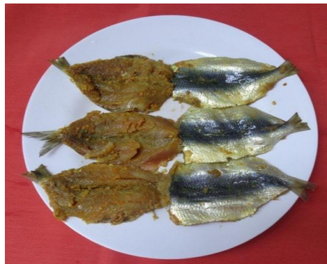
Figure 5. Wet Sardine ‘ Pedetans ’