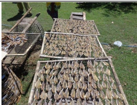
Figure 6. Drying Process