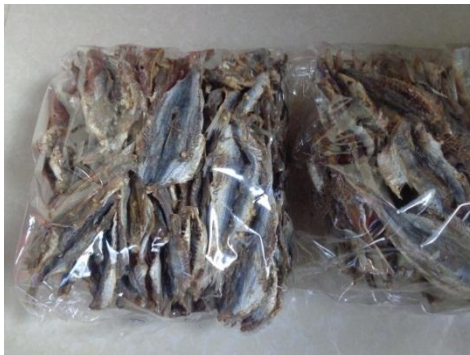
Figure 8. Wrapping and Packaging Processes

Spicing process was done after the fish were free from the washing water. In this process, the fish were rubbed with spices which have been grinded by stone mortar (Fig. 4). Producer 1 used the mixture of garlic, coriander, kampferia galangal, turmeric, vinegar, salt, and ginger to spice the fish, while Producer 2 used a different mixture, namely garlic, shallot, coriander, brown sugar, tamarind, and salt. On the other hand, Producer 3 rubbed their fish with the mixture of garlic, kampferia galangal, coriander, turmeric, and salt.