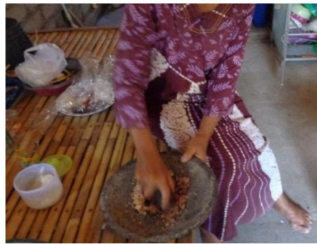
Figure 4. Grinding Process of Spices Mixture