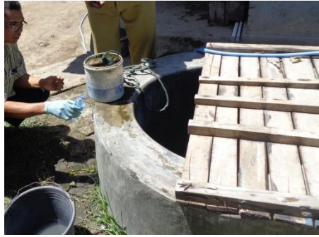
Figure 3. Well Water Source Used to Process Sardine ‘ Pedetan ’