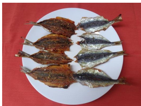
Figure 7. Dried Sardine 'Pedetan'