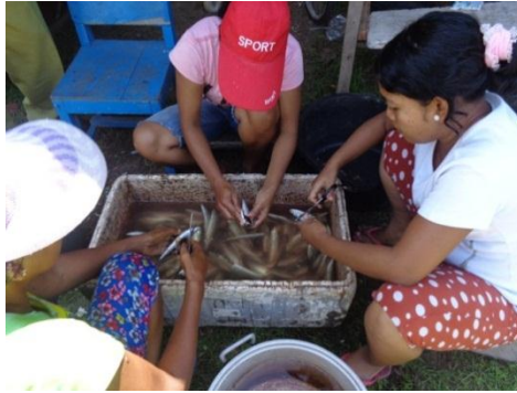
Figure 2. Cleaning and slicing processes

The processing of Sardine ' pedetans ' started when the processors gained the raw materials, continued by gutting process, butterflying process, washing process, spicing process, and drying process under the sun heat for 2-3 days. The processing of Sardine ' pedetans ' by producer 2 was carried out outdoor, exactly in the house yard owned by the leaders of the groups. On the other hand, the processing process by producer 1 and producer 3 was carried out in kitchens. From the three groups of producer, there were not discovered any toxic materials, hence the raw materials, the equipment, and the containers were safe from toxicant.