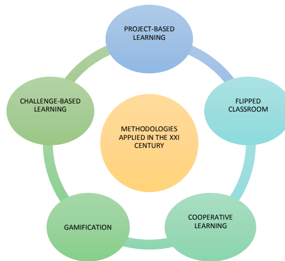
Figure 1. The main methodologies applied in the 21st century

The use of information technologies is a process that uses a composition of media and methods of collection, production and transmission of information, favorite resources of innovative teachers to create content that influences interactively and significantly in student learning causing an indirect and positive impact on the family environment, an experience that is common and positive (Psacharopoulos, 1994; Calderhead, 1989). For the development of the work, some methodologies developed by some authors were taken into account, as shown in Figure 1, the main methodologies applied in the 21st century, which are used today in the Ecuadorian educational system.