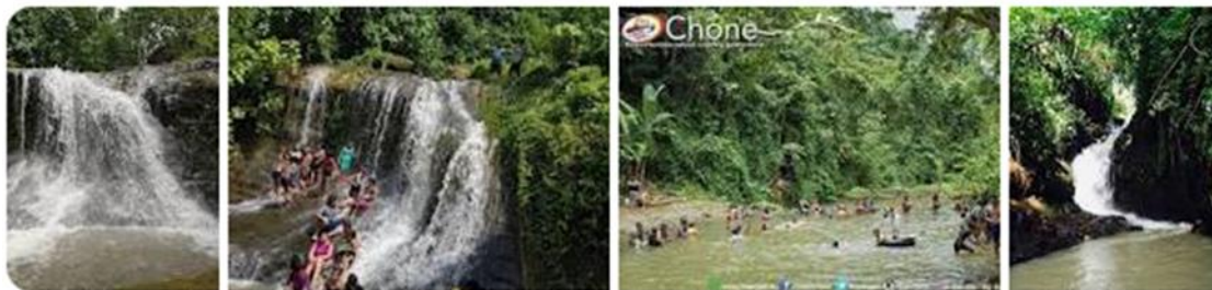
Figure 2. Images of the Caracol waterfall, near the Virgen de Guadalupe spa

The spa does not have a location record in Google Maps, but it can be directed to the location of the cascade caracol spa since the territories are united, and the only thing that separates them is a cane to know where each one begins or ends of them. Figure 2 shows some images of the snail waterfall near the Virgen de Guadalupe spa, as the landscapes suitable for tourism and rest for people who wish to visit it are observed.