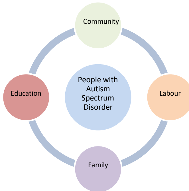
Figure 2. List of ASD social groups

Figure 2 details the social groups in which a person suffering from Autism Spectrum Disorder operates. There are several ways to be linked to Autism Spectrum Disorder in different social groups, however, to achieve this it is necessary to generate a culture of inclusion and awareness for acceptance, always considering the limitations and the great efforts they make to cope. interpersonal way.