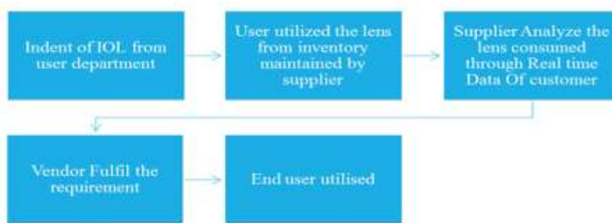
Figure 2. Steps involved in the process of Inventory Managed inventory system