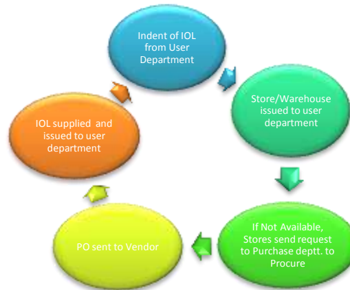
Figure 1. Steps of the process involved in Traditional Inventory management cycle

This process can lead to various issues in the supply chain process of the intraocular lenses or IOL's. Hoya (a multinational lens manufacturing organization) has adopted the advanced supply chain management system for the supply of Lenses. With the help of RFID system, the barcode attached is scanned and recorded in the system which can help in eyeing in the inventory of the lenses. As soon as the inventory is consumed the system will automatically create order as per the reorder level and send the information to the vendor to replenish the inventory of the warehouse so that there will not be any shortage of lens and can be timely supplied to the customer.