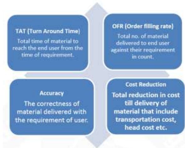
Figure 3. Matrix designed for measuring the performance of the supply chain and purchase function to assess the efficiency and improvement in the inventory management