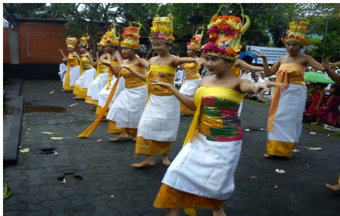
Figure 1. Rejang Dewa dance with Balinese traditional clothing

Arts and culture associated with the implementation of Hinduism displayed by Hindu artists in Praya are to accompany religious activities performed by Hindus in Praya city and surrounding area. Art and culture are displayed to accompany such religious activity are often called the sacred art. The sacred art appearance only served as an accompanist religious ceremony in the Hindu religious places, such as temples, sangghah , or other places associated with religious activities of the Hindu pantheon. The sacred cultural arts performances by the community commission very existence need to be preserved because it is very closely related to the existence of the Hindu religion. In connection with that, it is necessary to take steps to preserve the cultural arts in order to support the activities sradha and bhakti .