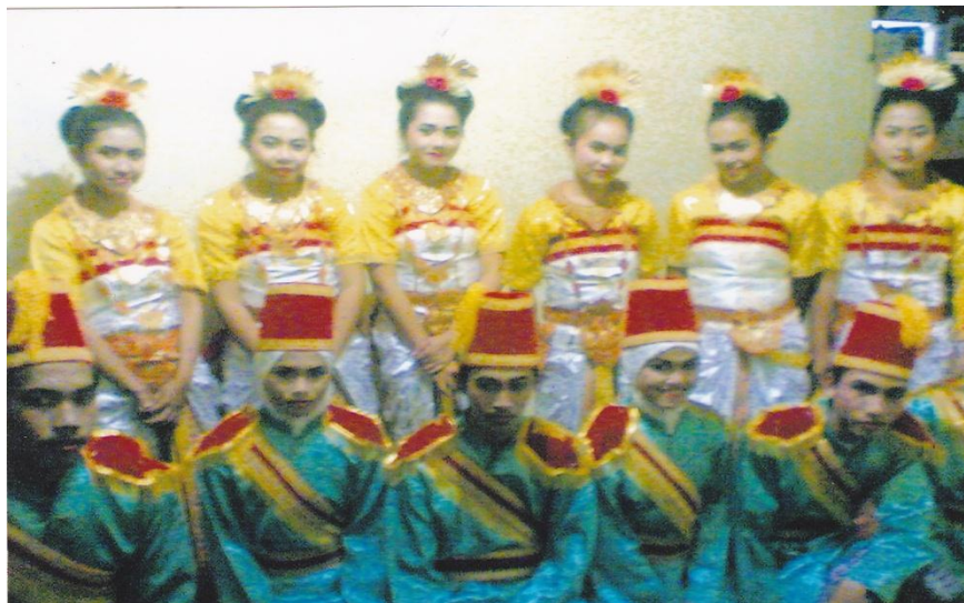
Figure 3. Rudat dance is a dance performed by Sasak people and Balinese people

The Cultural collaboration that occurs in Central Lombok regency, especially between Balinese culture with Sasak culture has a very important value in order to make innovations in the art of traditional culture. Innovation is very positive in raising new creations in traditional culture and art performances. Based on the results of field observations found that some elements of Balinese culture and Sasak cultures have similarities. These similarities, as in traditional clothing, traditional culture, and others. Based on this collaboration to bring art and culture not be a significant obstacle.