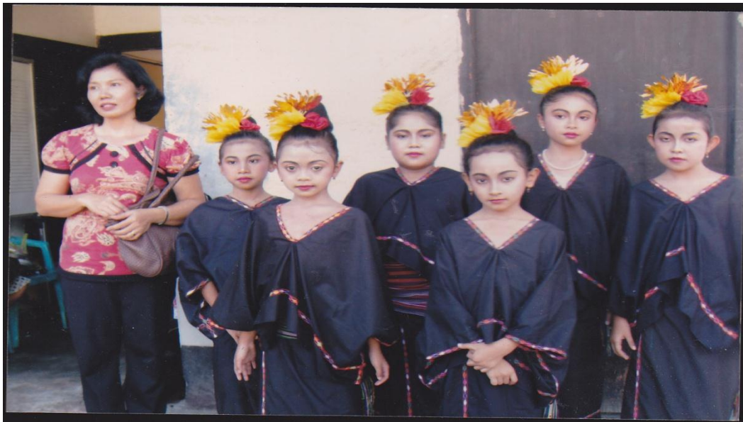
Figure 2. Sasak custom clothes

do innovation to maintain its appeal. The idea to combine the art of Balinese culture with the art of a Sasak culture is one way to maintain the viability of each culture. The cultural blend to get a positive response. Studio art and culture is one of the containers in realizing the cultural blend.