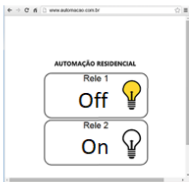
Figure 4: Control page. By the author.

Then the logic part of the project was loaded, to control the activation of the lamps, using the devices like smartphone, or computer with Internet access, and having as main base, the Arduino board, it receives the code that causes the Arduino works as a server, hosting the page that was developed so that the devices can control the lighting.