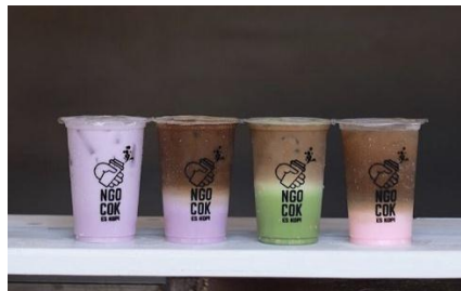
Figure 1. Display of Iced Coffee Coffee

Ngocok Es Kopi can compete during the emergence of coffee brands in Bali. Besides having a unique name and also a different packaging from other coffee shops, Ngocok Es Kopi appears different, which has the characteristics of a layer of drinks.