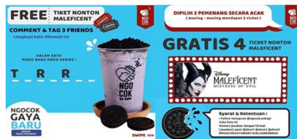
Figure 2. Promotion Program for Shaking the Iced Coffee

The influence of buyers' attractiveness routinely makes interesting quizzes very influential on product branding, because the rules in following the quizzes made by Ngocok Es Kopi are very easy, that is answering questions, follow on Instagram of Shaking Ice Coffee, like posting, then mentioning at least 3 friends with the original account and also includes hashtags from the Ngocok Es Kopi tagline. The importance of marketing using Instagram social media is the need for perseverance and consistency in posting material that will be advertised on Insta Story and also on Instagram feeds (Instagram pages). The aim is that the Instagram Ice Coffee followers will always remember the brand so that indirectly if they continue to see posts about Ice Coffee Coffee like consumer reviews, motivational sentences by including the Ice Coffee Ice logo, then the Ice Coffee Ice logo will be popular in the minds of Instagram followers Shake Ice Coffee.